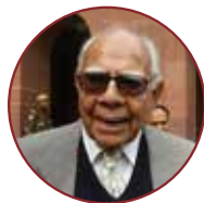
Ram Jethmalani (Late) Former Union Minister, Law & Justice; Chairman, Indian Bar Council