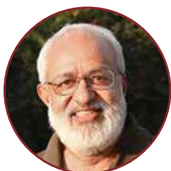
Prof. Pushpesh Pant Professor Emeritus