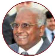
Justice K.G. Balakrishnan Former Chief Justice of India