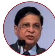
Justice Dipak Misra Former Chief Justice of India