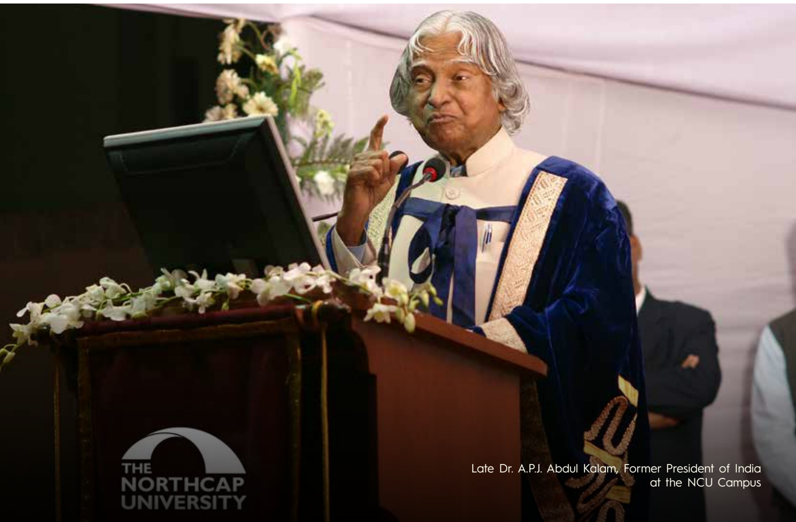
Late Dr. A.P.J. Abdul Kalam, Former President of India at the NCU Campus

Ranked: 'Amongst Top #5 Eminent Law Schools in India