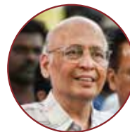
Abhishek Manu Singhvi Senior Advocate, Supreme Court of India