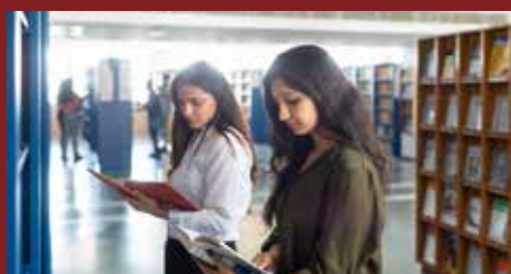
EBSCO Discovery and Academic Search Complete Service