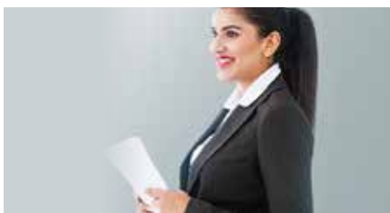
SCHOOL OF MANAGEMENT & LIBERAL STUDIES