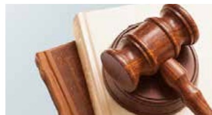
SCHOOL OF LAW