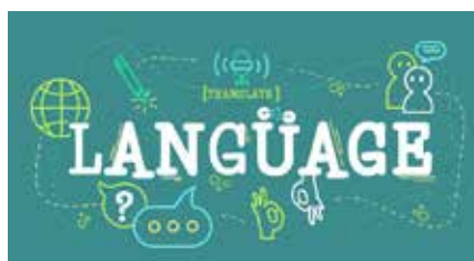
CENTRE FOR LANGUAGE LEARNING