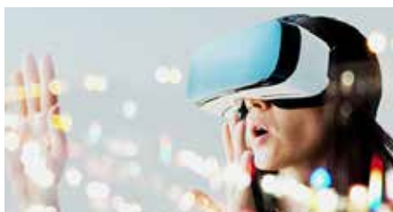
SCHOOL OF ENGINEERING & TECHNOLOGY

Our Undergraduate, Graduate, and Doctoral Programs are offered through: