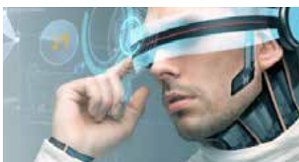
DEPARTMENT OF APPLIED SCIENCES