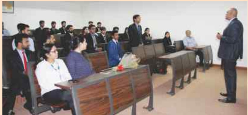
Director SPA welcomes Total IT Consult team

British Telecommunications , a British multinational telecommunications services company with head offices in London visited NCU for an on campus selection process for B Tech students. The company officials were highly appreciative of the quality of NCU students and made placement offer to 24 students.