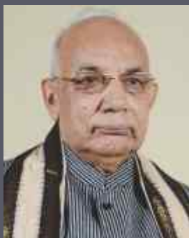
Hon'ble Prof. Kaptan Singh Solanki Governor of Haryana