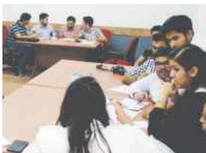
'YUMS - Yes, U May Speak'

CLL organized a two-day literary fest 'YUMS - Yes, U May Speak' on 6 and 7 April 2017. The events were moderated and judged by the founder members of