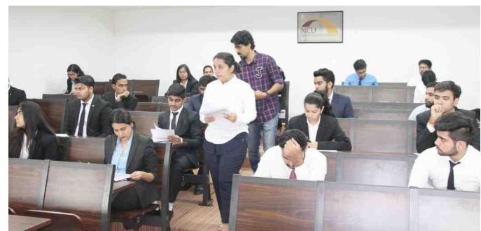
Protiviti Campus team during the Aptitude test.