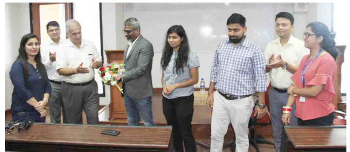
Decimal Technologies campus team being welcomed by SPA