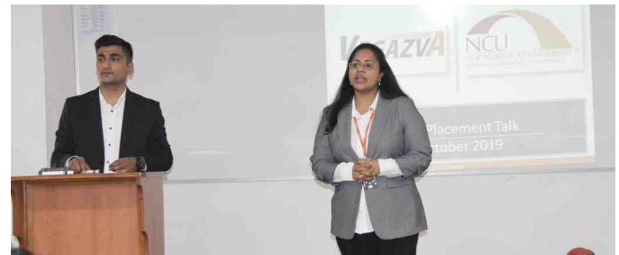
Vegazva Campus team during the Pre Placement Talk