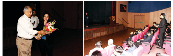
NCR Corporation Campus team during the Pre Placement Talk