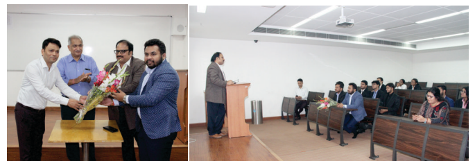
Express Roadways senior management being welcomed by SPA