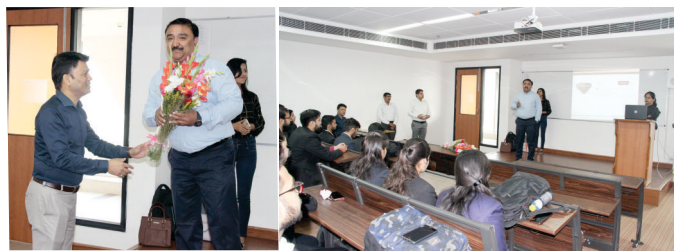
GenX Info Technologies campus team being welcomed by SPA