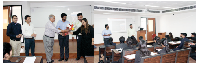
Jones Lang LaSalle - JLL campus team along with our alumni being welcomed by SPA