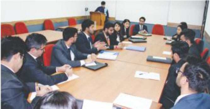
Students during the GD conducted by BYJU

BYJU'S - The Learning App is the popular brand name for Think and Learn Pvt Ltd., a Bengaluru based educational technology and online tutoring company. They conducted their campus selection process on 2 Jan 2018 for BTech (ECE) students wherein two student got the final offer.