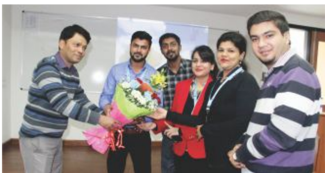
Campus team of Book My Tour Now being welcomed by SPA

Book My Tour Now , a leading online travel company, carried out its on-campus selection drive on 12 Feb 2018 for Technical and Management students and four students got the final job offer.