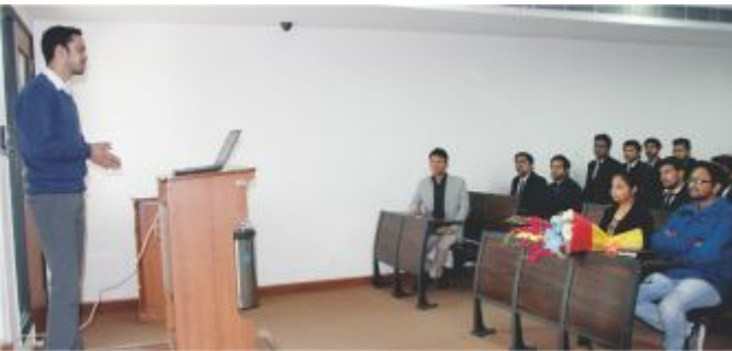
Exicom campus team interaction with our students during the ppt.

Exicom Power Solutions , designing, engineering and manufacturing the complete range of power solutions for the telecom, industrial, IT and other markets, conducted its campus selection process on 9 Feb 2018 for BTech students in which two students got the final offer.