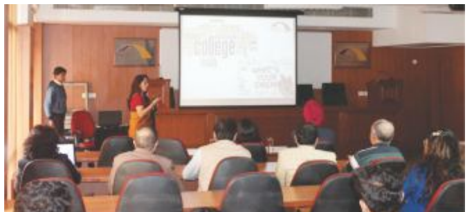
Counselling at NCU