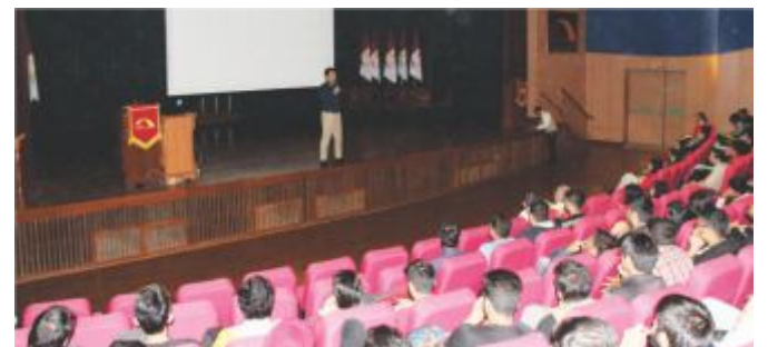
SPA Interaction during the session with 2nd & 3rd year students.

SPA conducted an interactive session for guidance regarding placements for BTech 2nd and 3rd year students (all branches) on 22 Feb 2018.