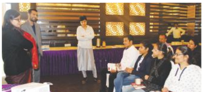
Counselling at Panipat